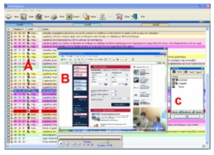
Figure 2. The main window of ActivityLens

In Figure 2 the main window of AL can be seen. The main window of AL consists of three (3) main areas which are: area A which contains textual information of observed activity mainly derived from log files, area B which consists of the multimedia files which represent user-system interactions and finally area C which offers various filters through which a subset of the activity can be presented, related to specific actors, or specific types of events.