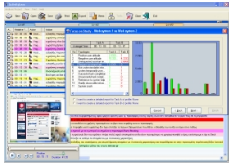
Figure 4. Competitive representation of low level usability features

We systemically studied the evaluation results in order to acquire a clear opinion about each of the three main usability attributes for both systems. Especially effectiveness for both systems proved to be successful since all users achieved to complete the booking tickets task.