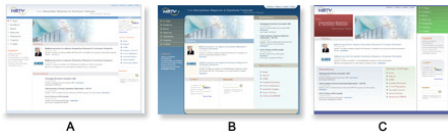
Fig. 1. University departments home page designs used in the experiment. Design A represents the high concinnity condition, B the balance condition, and C the high information .

In order to explore the usefulness of Coates theory an experiment was conducted in which the participants evaluated three alternative homepage designs of a university department’s website. Each design was prior assigned to one of the high concinnity , high information and balanced areas of the “Information – Concinnity” continuum (figure 1). In the initial phase of the study the three experimental designs were selected out of the six homepages which were identical in terms of text, images and logo but they differed in accordance to form, color, general layout and style. The homepages were designed with the intent to differ considerably in the “Information - Concinnity” scale. Given the complexity of the information and concinnity constructs we had the participants to evaluate their constituent components and then we calculated a score for each design. To that end forty four volunteer students (28 male, 16 female) of the university department in question evaluated the six homepages on Symmetry , Order , Contrast , Balance , Complexity and Novelty on a 9 point scale.