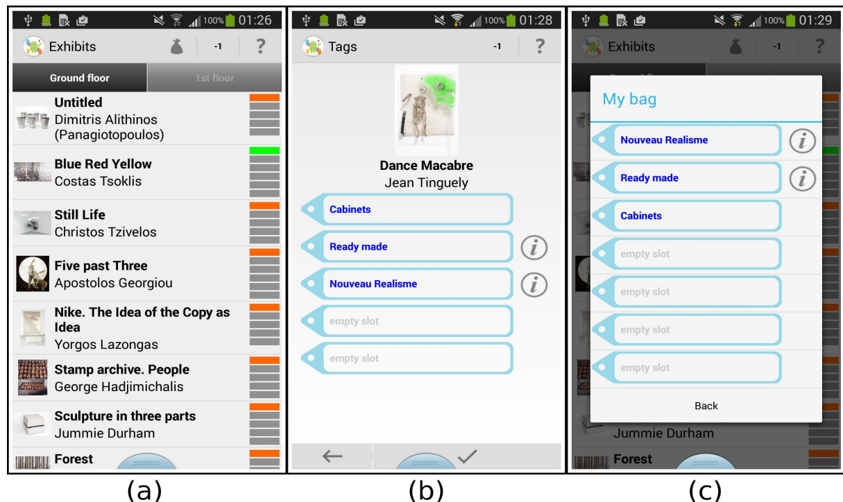
Fig. 1: (a) The main screen of the game. The artwork on the ground floor are shown. For each artwork there is a thumb-sized image, the title and the name of the artist. On the right number of correct, incorrect and empty tag-slots is shown. (b) The artwork 'Dance Macabre' is shown with 3 correct tags attached to it. There are still two empty tag-slots. (c) The player's bag with the tags that it currently contains. The icon 'i' on (b) and (c) displays a hint for the corresponding tag.

One key mechanic implemented in the game after an early evaluation session is the presence of extra information on some of the tags. This verbal information is a hinting mechanism and is presented in the form of short phrases (hints) that are meant to be explanatory or imply a new perspective to a tag, helping the player to make the connection with the correct exhibit. The player can request them by tapping on the 'i' icon next to a tag (Fig. 1-b/c).